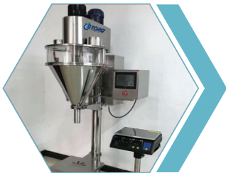
AUGER / POWDER FILLER MACHINE