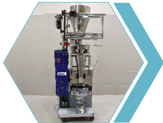
POUCH PACKING MACHINE