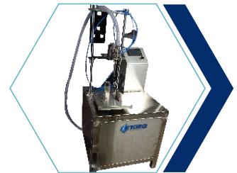
SEMI AUTOMATIC LOADCELL BASE FILLING MACHINE