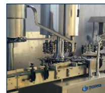
MULTI HEAD CAPPING MACHINE