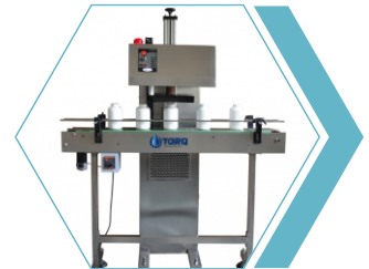
AUTOMATIC INDUCTION CAP SEALING MACHINE