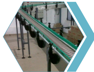
SLAT CHAIN CONVEYOR