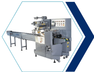
FLOW WRAPPING MACHINE