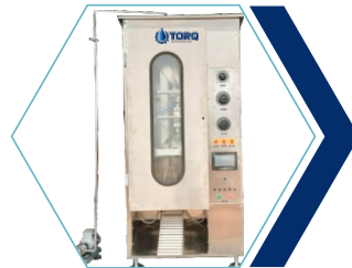
EDIBLE OIL POUCH PACKING MACHINE