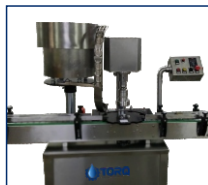
LUG CAPPING MACHINE